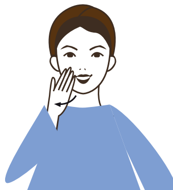
THANK [YOU] VERY