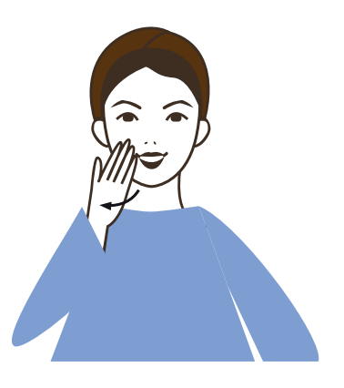
THANK [YOU] VERY